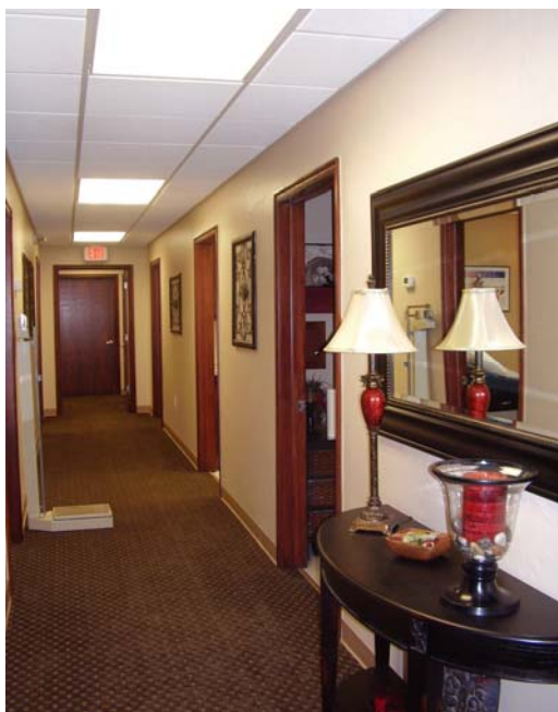
The main hallway

What are the benefits of being in your new location? “The benefits are numerous. Some of them are: associating with the medical field by locating near the hospital, a larger facility that triples the number of exam rooms and bring space for more medical volunteers, a large training/education room, and a better design to reach the abortion minded women in the Norman area.”