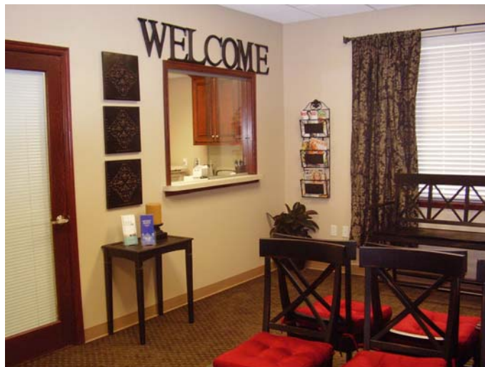
The new lobby at Care Net