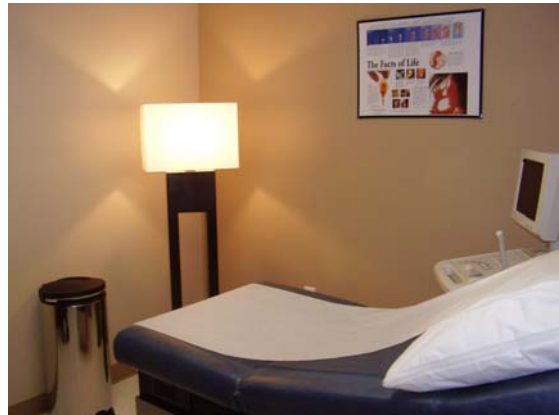
The ultrasound exam room

It is clear to see God’s hand moving and working in Care Net. We eagerly await to glimpse what will be accomplished in the lives of women in this new facility. May God be glorified with this vital ministry!